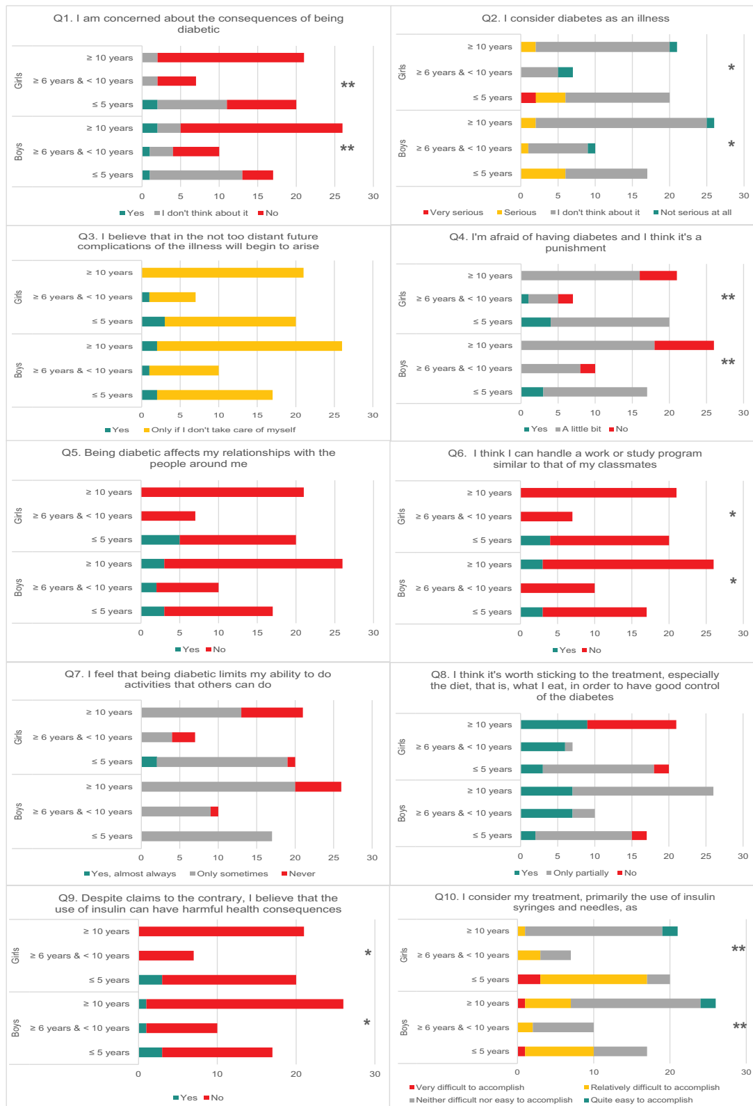
Figure 1 Analysis of the answers to the questionnaire “Modified Diabetes Quality of Life” divided by age and gender groups. *P<0.05 or **P<0.001 when comparing age groups.