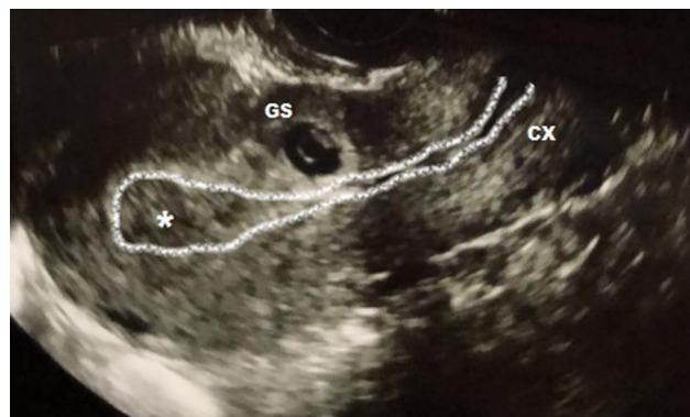
Figure 1 Transvaginal ultrasound showing cesarean scar pregnancy. *Empty endometrium with empty, closed cervix.

After informing the patients about the risks of hysterectomy, bleeding and bladder injury that transabdominal ultrasound-guided S&C + Foley balloon entailed, Karman cannula number 4 was used to access the sac level via the