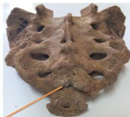
Apex at S 5