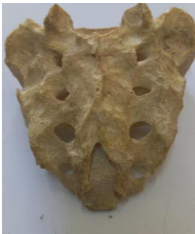
Figure 4 Schematic representation of inverted-V shape of SH.