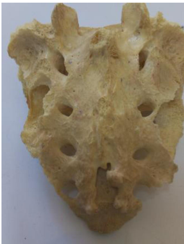
Figure 3 Schematic representation of irregular shape of SH.