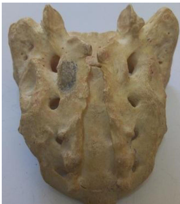
Figure 6 Schematic representation of complete bifida.