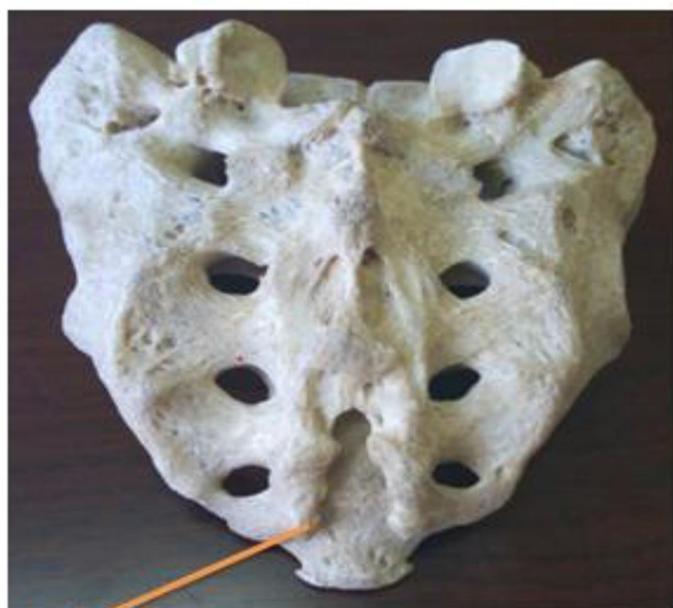
Base at S 5