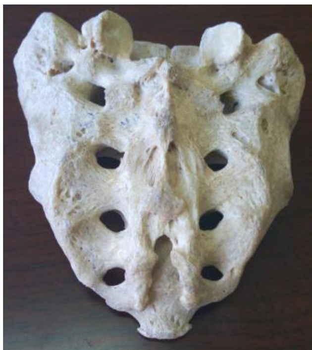
Figure 1 Schematic representation of dumb-bell shape of SH.