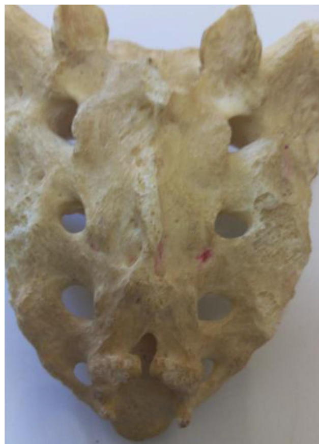
Figure 2 Schematic representation of bifida shape of SH.

cases, the base was found at the first coccygeal level (Table 3) (Figures 9 and 10).