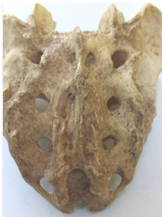
Figure 5 Schematic representation of inverted-U shape of SH.