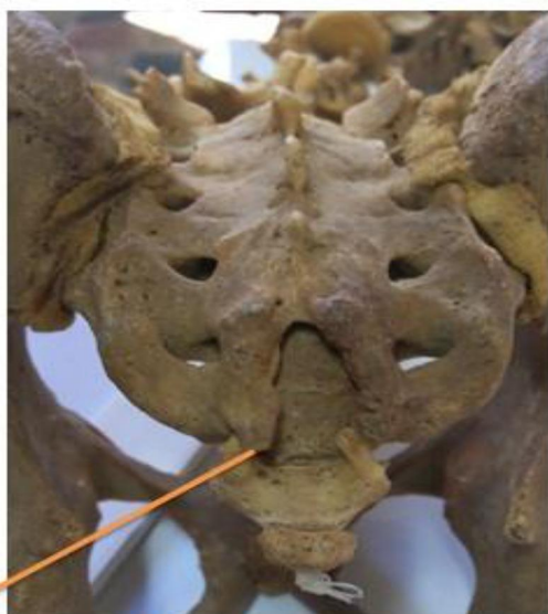
Base at Co 1