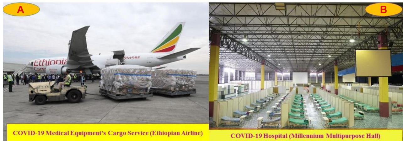
Figure 2 Ethiopian Airline Cargo Services (A) and new COVID-19 hospital in Ethiopia (B) Millennium Multipurpose Hall.

emergency crises national response. 16 Jack Ma & Alibaba Foundation, Bill & Melinda Gates Foundation, and Byte Dance & Tik Tok have generously donated COVID-19 testing kits, PPE materials, and financial support which would worth millions of USD. The government also got €10 million to support the preparedness and response plan to the pandemic, African development bank provided a regional (continental) floating fund grants, European Humanitarian Aid and Civil Protection (ECHO), United Nation's Central Emergency Response Fund (CERF), Korea International Cooperation Agency (KOICA), and German Development Cooperation. These all bilateral, and multilateral supports are the result of effective foreign and diplomatic relationships. 16