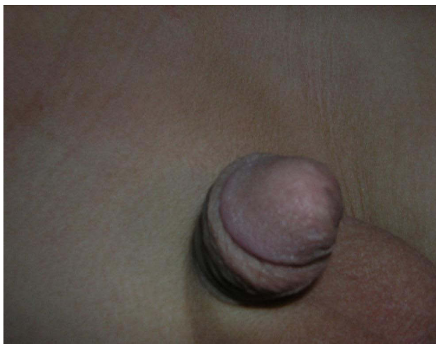
Figure 4 Final appearance post circumcision.

Objective Scoring Evaluation (HOSE) was used to evaluate the final outcomes after repair. 6