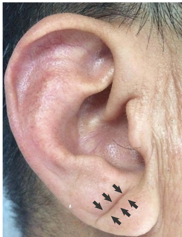
Figure 1 Typical example of the unilateral earlobe crease. The arrow shows earlobe crease.

In short, the earlobe structure is first drawn in a sitting position. The characteristics (eg, length, depth, width, and the number of creases) of each earlobe crease were recorded and evaluated. In each ear, a deep and clear ELC that extends completely through the earlobe is scored as 2 points, and an ELC that is marked as superficial or not completely through the earlobe is scored as 1 point, and 0 for ears in which no ELC was observed. The ELC score in each case represents the total score of both ears. The two-sided ELC in this study was defined as a score \geq 3 . If ELC is observed on at least one earlobe, we assign the patient to the ELC group (Figure 1). The two authors took digital photographs of the earlobes for independent evaluation