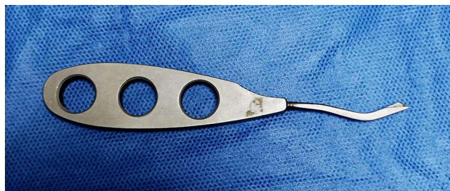
Figure 1 Photograph of a modified acupotomy.

The modified acupotomy treatment was performed in the outpatient operating room by an experienced hand surgeon. At the beginning, the location of A1 pulley was marked on the skin of the affected thumb according to a previous study. 16 After skin sterilization, local anesthesia was established by administration of 2 mL of 2% lidocaine. Next, a longitudinal incision of 3 mm was made with a No. 11 scalpel at approximately 1 cm proximal to the A1 pulley when the thumb was held in extension (Figure 2A). The modified acupotomy was then inserted into the same track to reach the proximal edge of the A1 pulley (Figure 2B). The blunt tip and extended edge helped the surgeon to confirm the proximal edge of the A1 pulley, and slipped the device into the space between the A1 pulley and the underlying flexor tendon minimizing the damage of the flexor tendon. The whole A1 pulley was incised along the direction of the flexor tendon with the sharp