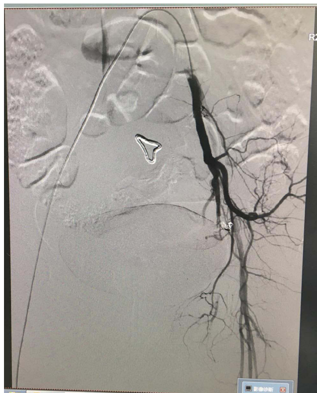
Figure 2 This is a radiograph after surgery. No obvious contrast extravasation was observed, indicating successful embolization.