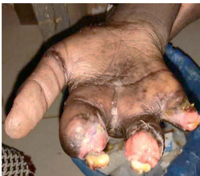
Figure 1 Right hand of the patient post middle finger amputation, demonstrating extensive digital ulceration.

Hand x-ray shows reduced bone density at the distal end of the radius and ulna, carpal bone, and metacarpophalangeal joint with a fracture in the index and ring fingers and an amputated middle finger (Figure 2).