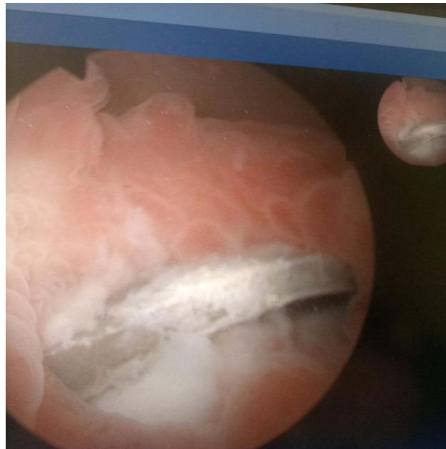
Figure 2 Cystoscopy picture showing, part of the plastic cap into the posterior bladder wall, covered with debris and tiny multiple bladder stones.