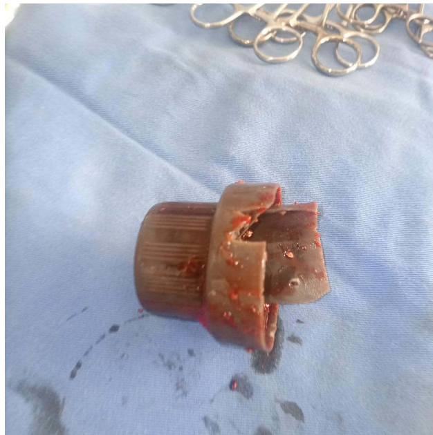
Figure 4 The removed plastic cap.

After the removal of the cap, there was a 5cm by 4cm VVF seen from the vaginal side with indurated and fragile edges, and there was a scar band on the proximal one-third of the vagina which was divided. The fragile and scared edge of the fistula was removed and refreshed. The vaginal pack was left in situ to prevent adhesion and stenosis and removed after 48hrs. An Eighteen FR size urinary catheter connected to urine bag was left in situ for two weeks with the intention of allowing tissue healing for later repair. She was not restricted to assume any position. She had minimal urinary leakage in the first 48 hours after catheterization. Then after she was dry. Upon removal of the catheter after 14 days, the fistula was closed spontaneously, and the patient was discharged continent.