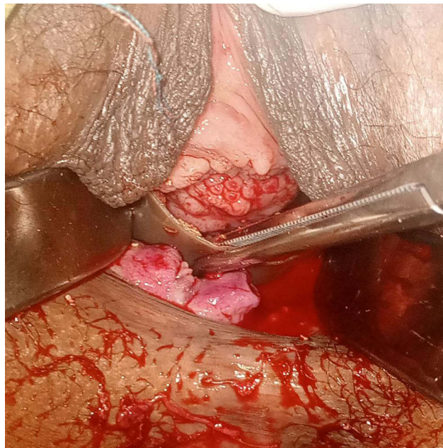
Figure 3 The plastic cap on the process of removal.