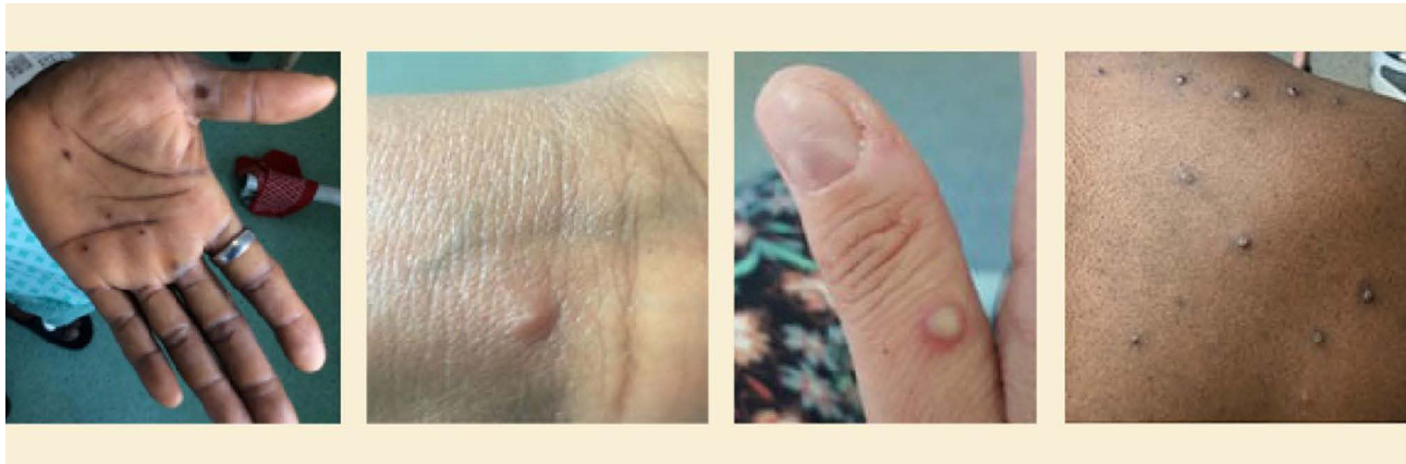
Figure 2 A visual example of Monkeypox rash. The rash is in form of lesions that are the commonest sign of Monkeypox disease. These evolve in four stages; Macular (a flat lesion), Papular (an elevated lesion), Vesicular (a fluid-filled lesion) and Pustular (an inflamed, pus-filled lesion) after that, they scab and flake. Photo Credit: NHS England High consequence Infectious Diseases Network. Adapted from Centers for Disease Control and Prevention. Monkeypox in the US [Internet]; 2022. Available from: https://www.cdc.gov/poxvirus/monkeypox/transmission.html . 12

progression, these skin changes resemble chickenpox or syphilis. There may be nodules, blisters, or pustules. Typically, they begin on the face and then spread to other body parts, such as the legs and arms (Figure 2). Some of the cases reported in May 2022 also involved genitourinary skin lesions. 16