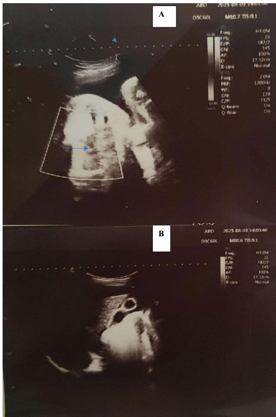
Figure 1 Abdomino-pelvic ultrasound, 25 years old pregnant lady at 33 weeks gestation with spontaneous hemoperitoneum due to rupture of uterine vessels.

Notes: The image labeled (A) showing intrauterine pregnancy, blue arrow showing no colour flow on the fetal heart. The image labelled (B) showing right upper quadrant abdominal ultrasound, white arrow showing free fluid in the hepatorenal recess.