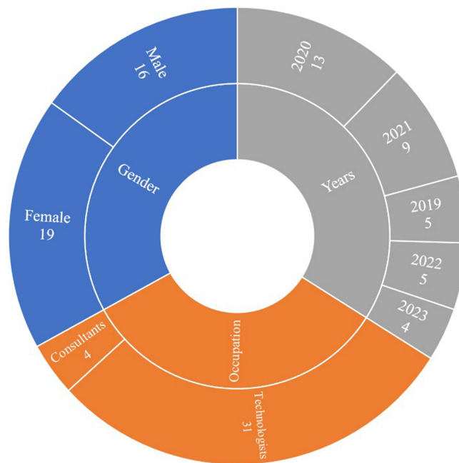
Figure 2 Counts of instances exceeding 1 mSv AMED by gender, occupation, and year.