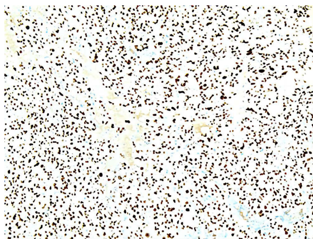
Figure 3 Specific nuclear positivity for TTF-1 in thyroid follicles.

was discovered in the thyroid capsule, perineurium and vasculature. The detection of BRAF V600E mutation was positive in the left lobe of the thyroid gland.