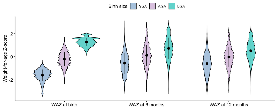
Figure 1 Weight for age z-score by birth size and age (SGA, small for gestational age; AGA, appropriate for gestational age; LGA, large for gestational age; WAZ, weight-for-age z-score).

In line with previous studies using the INTERGROWTH-21st birth weight standards, we observed an SGA prevalence of 8.0% and an LGA prevalence of 6.5% among full-term singleton infants. These findings are similar with research conducted in China, employing the INTERGROWTH-21st birth weight standards, which reported comparable proportions for SGA and LGA classifications. 22,23 Moreover, we observed that mothers of SGA infants tended to be younger compared to AGA and LGA mothers, suggesting a potential association between maternal age and