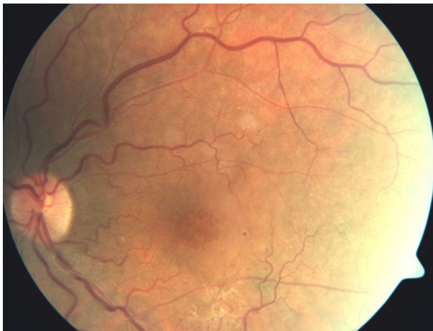
Figure 1 Fundus photograph of the left eye showing a tortuous retinal vein with a few retinal hemorrhages in the inferotemporal quadrant and macular edema.

fluorescein angiogram findings, and medical history of the patient. Optical coherence tomography (OCT) revealed a partially separated posterior vitreous membrane pulling up the fovea (Figure 3A). The steep posterior hyaloid curve and the thickened cystoid fovea were suggestive of vitreomacular traction. OCT also showed a large pocket of subretinal fluid, indicating the presence of sensory retinal detachment. The decreased vision was considered to have arisen from photoreceptor atrophy as a result of chronic macular edema, which is due to vitreomacular traction. The disruption of the photoreceptor inner segment–outer segment junction seen on OCT also confirmed this finding. Although pars plana vitrectomy was recommended, the patient refused surgical treatment. The patient was treated with 4 mg/0.1 mL of intravitreal TA (IVTA) so as to reduce macular edema and