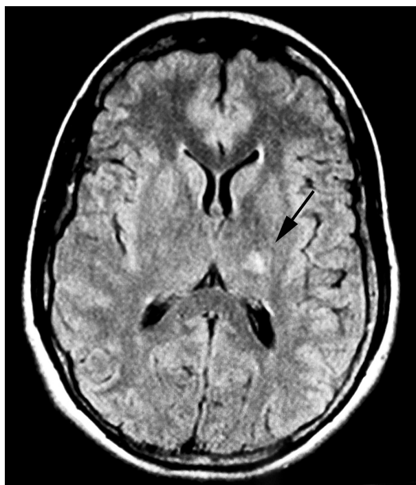
Figure 2 Cerebral magnetic resonance imaging.

Note: Images of interstitial disease are visible in the right medial segments and in the left basal area of the lung (white arrows).