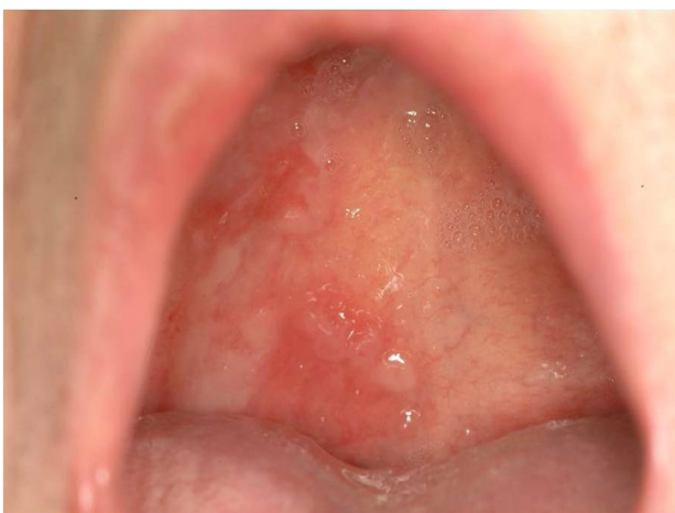
Figure 2 Hard-palate ulceration.

The pathogenesis of the condition is not completely understood. OCP has been described as a type II immune reaction characterized by the deposition of immunoreactants (immunoglobulin G, immunoglobulin A, immunoglobulin M, and/or complement) along the epithelial basement membrane zone. One particular antigen, the \beta 4 subunit of \alpha 6\beta 4 integrin, has been identified as the target in the basement membrane zone of the conjunctiva and epidermis for the immune reaction in OCP. 2 Autoantibodies are produced against a variety of adhesion molecules in the hemidesmosome–epithelial membrane complex. Production of proinflammatory cytokines stimulates migration of lymphocytes, eosinophils, neutrophils, and mast cells to the basement membrane. Fibroblast activation interferes with collagen production, eventually resulting in cicatricial changes in the conjunctiva. The resulting fibrotic changes cause dry eye, meibomian