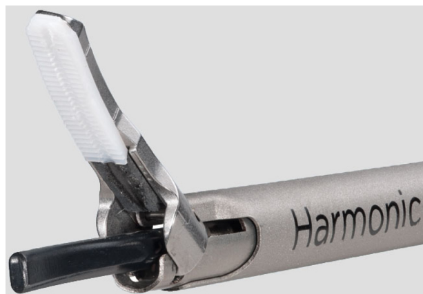
Figure 1 End effector of the Harmonic ACE ® + Shears (Ethicon Endo-Surgery, Inc., Cincinnati, OH, USA).

There were no complications during the acute procedures and all but one animal in the 30-day study survived until the appointed time. A single animal was found deceased after 18 days due to unrelated causes; all vessel seals were healing normally with no evidence of bleeding.