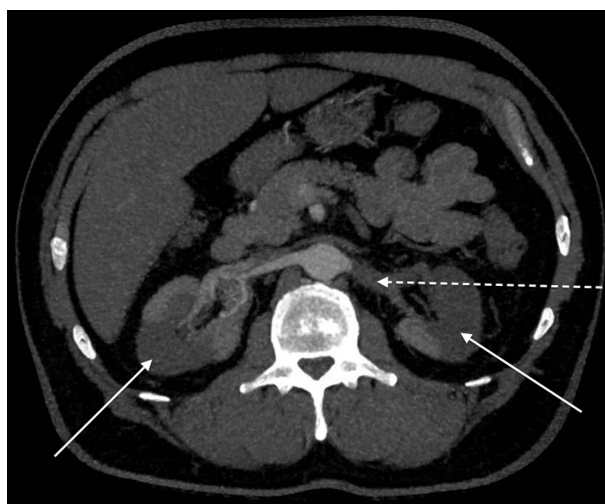
Figure 2 Computed tomography showing bilateral renal infarcts (arrows) and left renal artery occlusion (broken arrow).

Six months later, his creatinine had stabilized to 1.98 mg/dL (175 \mu mol/L), equating to an estimated GFR of 36 mL/min/1.73m 2 . Blood pressure control required treatment with a combination of three agents. Urinary protein:creatinine ratio measured 698 mg/g and microscopic hematuria persisted.