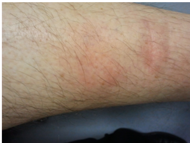
Figure 2 Erythema nodosum under HCV-triple therapy.

Antiviral therapy of recurrent hepatitis C after LT is an issue of great interest, particularly as the time course of fibrosis progression is accelerated under immunosuppression. 2