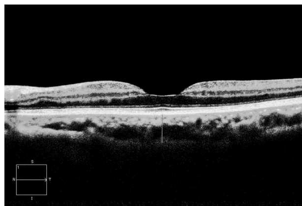
Figure 1 From cirrus high-definition Optical Coherence Tomography, high-definition one-line raster-scan protocol with capturing 20 B-scans at a single location and applying unique Selective Pixel Profiling™ software on enhanced depth imaging mode to obtained high quality image.

All subjects underwent ophthalmologic examination, including best-corrected visual acuity, intraocular pressure measurement, axial length, spherical equivalent of RE, color fundus photography, and OCT with a Cirrus HD-OCT (Carl Zeiss Meditec, Dublin, CA, USA) with and without EDI mode were recorded. The EDI-OCT was performed between 1 and 3 pm to prevent circadian variations. Subfoveal choroidal thickness was measured from the vertical distance between the outer border of the hyperreflective line corresponding to the retinal pigment epithelium and the inner surface of the hyperreflective line corresponding to the chorioscleral interface at the fovea region. To maximize the signal-to-noise ratio, new software generated a high-definition one-line raster scan by capturing 20 B-scans at a single location and applying unique Selective Pixel Profiling™ software to the scans to obtain a higher-quality image. With segmentation methods, subfoveal choroidal thickness was measured retrospectively using the planimetric-scale software in the device (Figure 1). Both hyperreflective lines