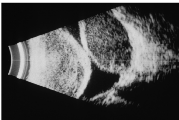
Figure 2 B-scan echography demonstrating an example of appositional suprachoroidal hemorrhage.

We used a large nationwide insurance claim-based database to assess the 3-month cumulative incidence rate and recorded surgical treatments of postoperative suprachoroidal hemorrhage after trabeculectomy and tube shunt procedures.