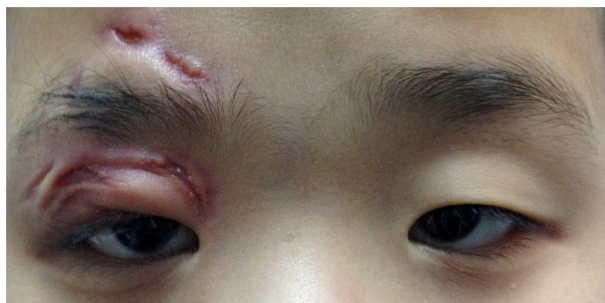
Figure 3 Right upper eyelid healed with scarring but without ptosis at 3 months post-removal of Gore-tex material.

A swab of the purulent discharge was sent for culture and sensitivity. However, the culture did not yield any growth. At 1 week post-incision and drainage, the right upper eyelid was still inflamed and swollen with partial mechanical ptosis (Figure 2).