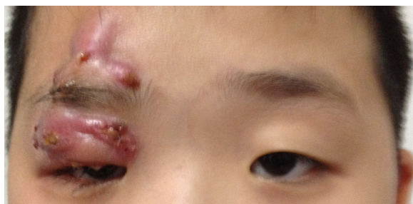
Figure 2 Right upper eyelid still swollen and inflamed with partial mechanical ptosis at 1 week post-incision and drainage procedure.

The patient was admitted and treated with intravenous co-amoxiclav 800 mg (25 mg/kg) 8-hourly for a duration of 1 week. Chloramphenicol ointment was applied 8-hourly to the infected surgical wounds, together with instillation of topical chloramphenicol eye drops 6-hourly to the right eye. An emergency incision and drainage of the right upper eyelid was performed, and about 5 mL of pus was drained out.