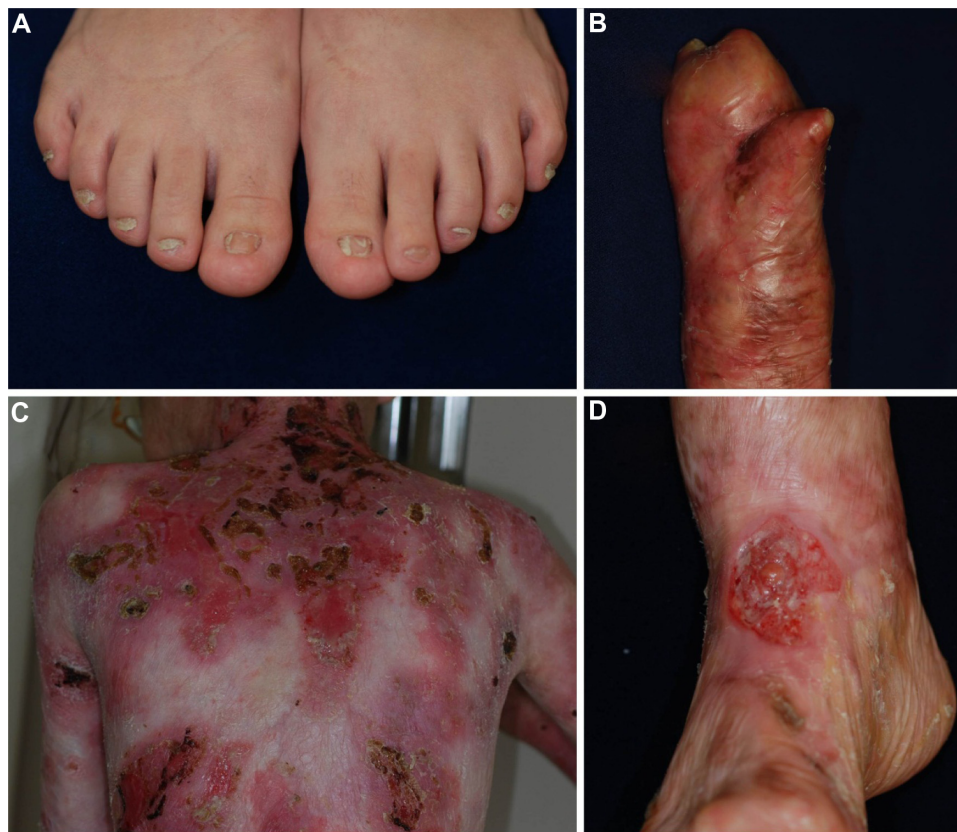
Figure 1 Clinical features of dystrophic epidermolysis bullosa.

RDEB, generalized severe is associated with numerous extracutaneous manifestations including involvement of the gastrointestinal tract, genitourinary tract, kidneys, and heart. 35,36 Children with RDEB, severe generalized are at an increased risk of glomerulonephritis, renal amyloidosis, IgA nephropathy, and cardiomyopathy. 37,38 Notably, patients have a high likelihood of developing aggressive squamous cell carcinoma (Figure 1D). 39 Patients rarely survive beyond age 30, due to severe renal complications or aggressive squamous cell carcinoma. 31