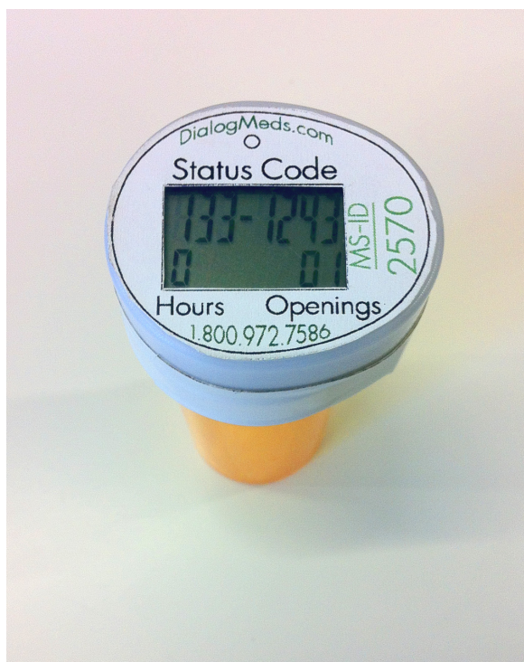
Figure 1 Illustration of an automated pill cap to monitor pill adherence in patients with bipolar disorder (BD).

This was a prospective analysis of a multicomponent, technology-assisted adherence enhancement system in five patients with BD, who tested the system over a 15-day period. The DialogMeds-BD system (Figure 1) is designed to address the barriers to adherence in BD patients. The DialogMeds-BD components include: 1) an automated pill cap with remote monitoring sensor; 2) a multimedia adherence enhancement (MAE) program; and 3) a treatment incentive program (TIP) for motivating patients to remain adherent and improve treatment-related knowledge and skills. System data are intended for viewing by clinicians in real-time, web-based format, which can be used to help in treatment planning and medical decision-making. This preliminary study evaluated