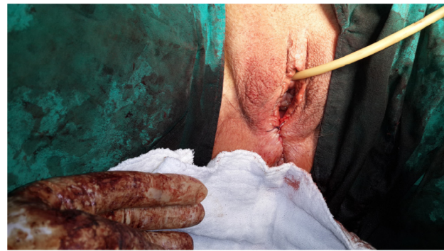
Figure 3 The same patient of Figure 1 after the vaginal introital epithelium was approximated with an absorbable running suture, leaving the resultant genital hiatus of about 1 cm in length.

A total of 79 patients were operated. Of these 79 patients, 12 did not respond to phone calls, six patients moved or died, and seven patients did not agree to participate in the study. There was no significant difference between the study group