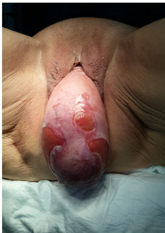
Figure 1 A patient with stage 4 pelvic organ prolapse.

Demographic characteristics, including age, parity, mode of delivery, and the presence/absence of hypertension and diabetes, were recorded. All patients provided detailed histories and underwent complete gynecological examinations. Prolapse assessment was performed by a specialist, using the POP quantification (POP-Q) system. 16 Objective recurrence