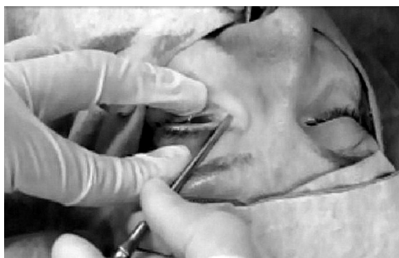
Figure 2 Trocar inserted through the lacrimal bone.

A minimally invasive approach with no skin incision has been described. 9,10 However, placement of a Jones glass tube can be difficult with this technique. The distal end is