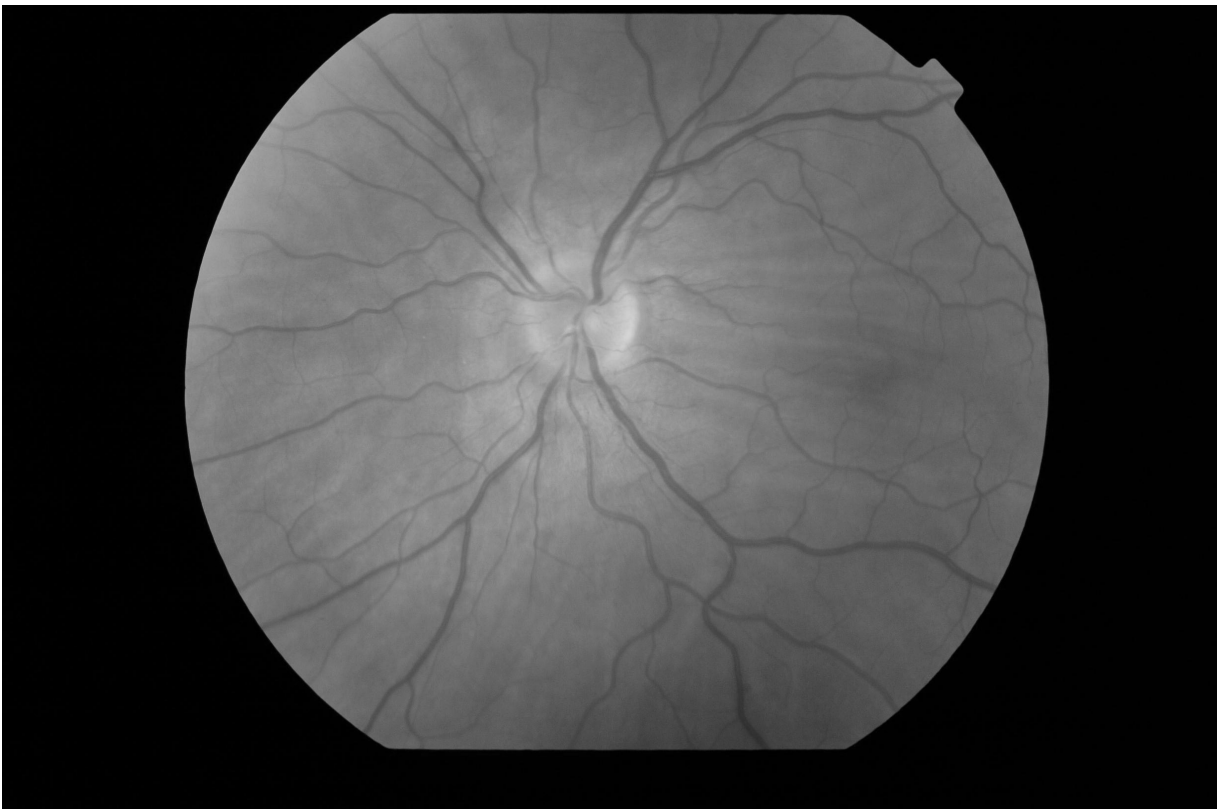
Figure 3 Normal left optic disc.

In summary, optic nerve dural ectasia is a saccular dilatation of the optic nerve sheath. It can be suspected based on the evidence of visual blurring or retrobulbar pressure. Ocular examination may show signs of optic nerve dysfunction. Choroidal folds and hypermetropic shift are suggestive of a meningocele. The radiological investigation of choice is MRI with techniques to emphasize high spatial resolution and optic nerve anatomy. Surgical intervention is reserved for severe cases.