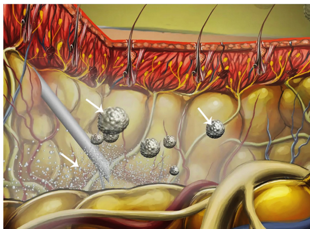
Figure 1 Schematic image of an injection of liposome bupivacaine into the surgical site. Notes: White arrows point to liposomes; white haze illustrates free bupivacaine contained in liposome bupivacaine solution.

In 2012, Dasta et al 11 reported results from a pooled analysis of nine clinical studies of liposome bupivacaine administered intraoperatively at the surgical site as part of a multimodal