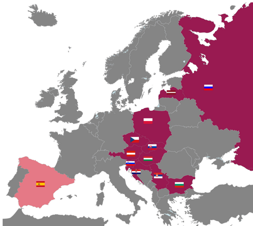
Figure 1 Map of participating countries.

The primary aim of this study was to assess the prevalence of COPD phenotypes according to predefined criteria in an unselected group of consecutively examined patients with stable COPD in the CEE region in a real-life setting (Figure 2). Secondary aims of the study included analysis of differences in symptom load, and diagnostic and therapeutic behavior in patients classified into different phenotypes. As the POPE study will actively recruit patients with COPD due to environmental risk factors other than smoking, separate analysis will be