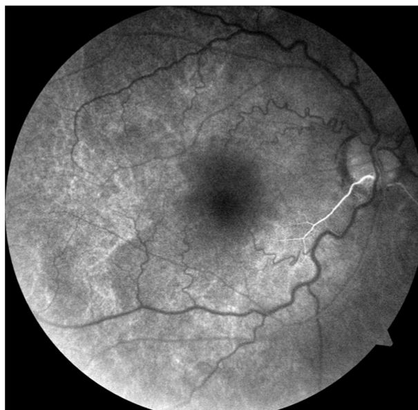
Figure 3 The cilioretinal artery begins to fluoresce at early phase angiogram (13.7 seconds).

normal. The visual field test using a 10-2 threshold Humphrey computerized automated perimeter was also normal.