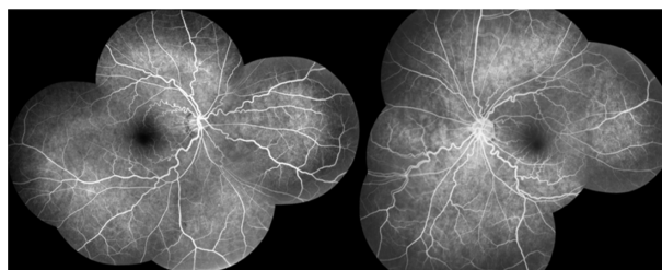
Figure 4 FFA photograph of both eyes showing obviously tortuous and dilated retinal veins.

The anomalous tortuosity and dilatation of the retinal vessel without other abnormality is rare, making the accurate estimation of incidence difficult. Gauss 2 estimated that the tortuosity of retinal arteries alone was twice as common as that of the veins. Walsh and Hoyt 3 and Awan, 4 however, hold an opposing view. In a retrospective analysis that evaluated