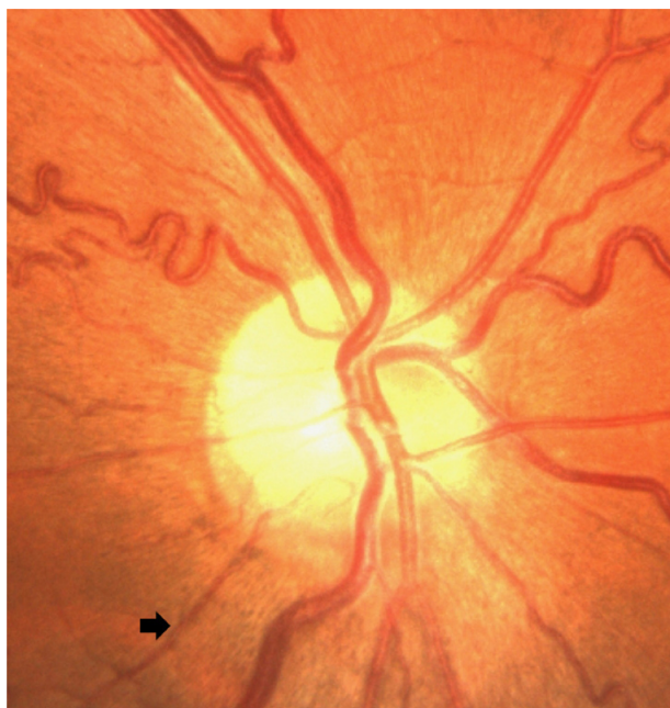
Figure 2 The cilioretinal artery course inferotemporally from behind the disc margin (arrow).

All the supplementary tests, such as contrast sensitivity, color test, Amsler grid, and electrophysiologic test, were