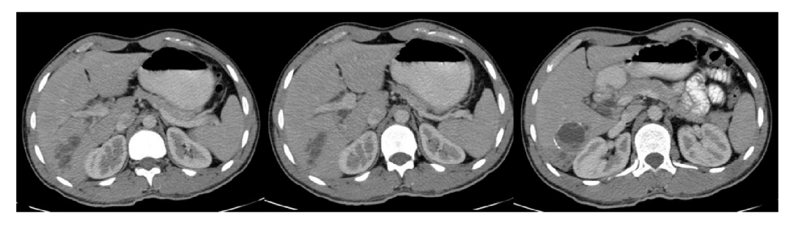
Figure 2 A 20-year-old male with pain in the right upper abdomen.

Notes: Axial CT revealed a cyst. The cyst was of type 4, localized in segment 6, and 4 cm in diameter. CT showed mild–moderate dilatation in the right hepatic bile duct and intrahepatic defect in the subcapsular area of the posterior cyst wall.