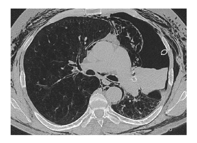
Figure I Multi-detector CT.

Note: Chest tube insertion because of pneumothorax following valve placement in the left upper lobe.