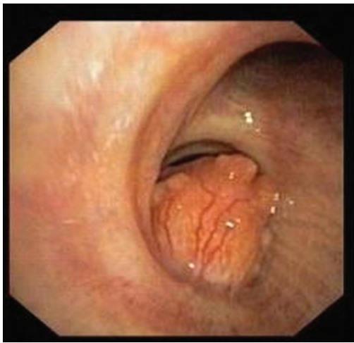
Figure 3 Fiberoptic bronchoscopy revealed a well-circumscribed polypoid endobronchial lesion that almost completely obstructed the lumen of the intermediate bronchus.

Computed tomography and magnetic resonance imaging (MRI) are reported to be helpful in establishing the diagnosis by demonstrating a fatty tumor within the bronchial lumen. CT is highly specific and sensitive for the detection of fat, and the presence of fat within a lesion suggests a benign etiology, such as lipoma or hamartoma. 8,9 Several reports of MRI appearance of lipoma have shown high signal intensity on T1-weighted images and intermediate signal density on proton density and T2-weighted images, compatible with normal fat. 10 Although fiberoptic bronchoscopy is the most valuable method of diagnosis of endobronchial lesions, it is not usually sufficient to make diagnosis of endobronchial lipomas, as in our case. Thus, surgical or bronchoscopic resection must be performed in order to reach final diagnosis. Although endobronchial removal with laser therapy is the preferred treatment option, 9 the patient underwent right thoracotomy and bronchiotomy since we had technical difficulties related to interventional bronchoscopy.