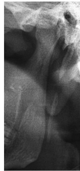
Figure 4 Type III – segmented styloid process.