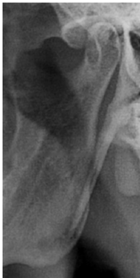
Figure 2 Type I – uninterrupted styloid process.