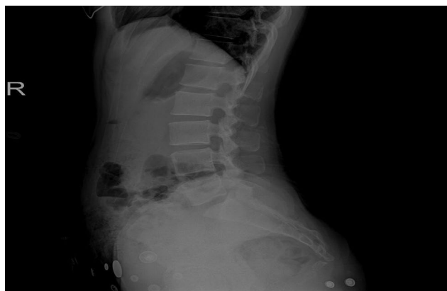
Figure 3 Total excision preoperative view.

The VAS scores of the patients were evaluated at 6 months, 12 months, and the final follow-up examination postoperatively. The degree of relief in the painful area