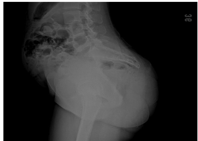
Figure 4 Total excision postoperative view.