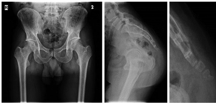
Figure 1 Partial excision preoperative images.