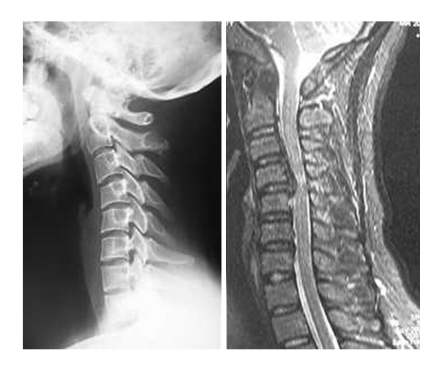
Figure I Global type of cervical kyphosis. Note: All the centroids are posterior to the C2–C7 centroid line, and the distance between at least one centroid and the line is \geq 2 mm.