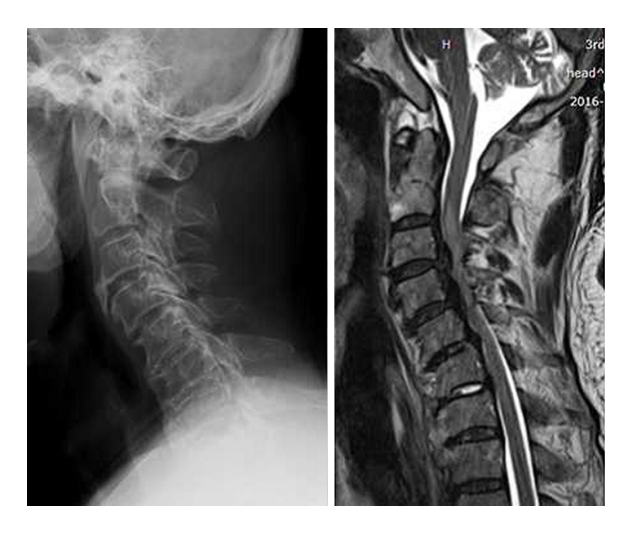
Figure 3 Sigmoid type of cervical kyphosis.

Note: At least one of the upper cervical centroids is anterior to, and at least one of the lower cervical centroids is posterior to, the C2–C7 centroid line, and the distance between the C2–C7 centroid line and at least one centroid is \geq 2 mm.