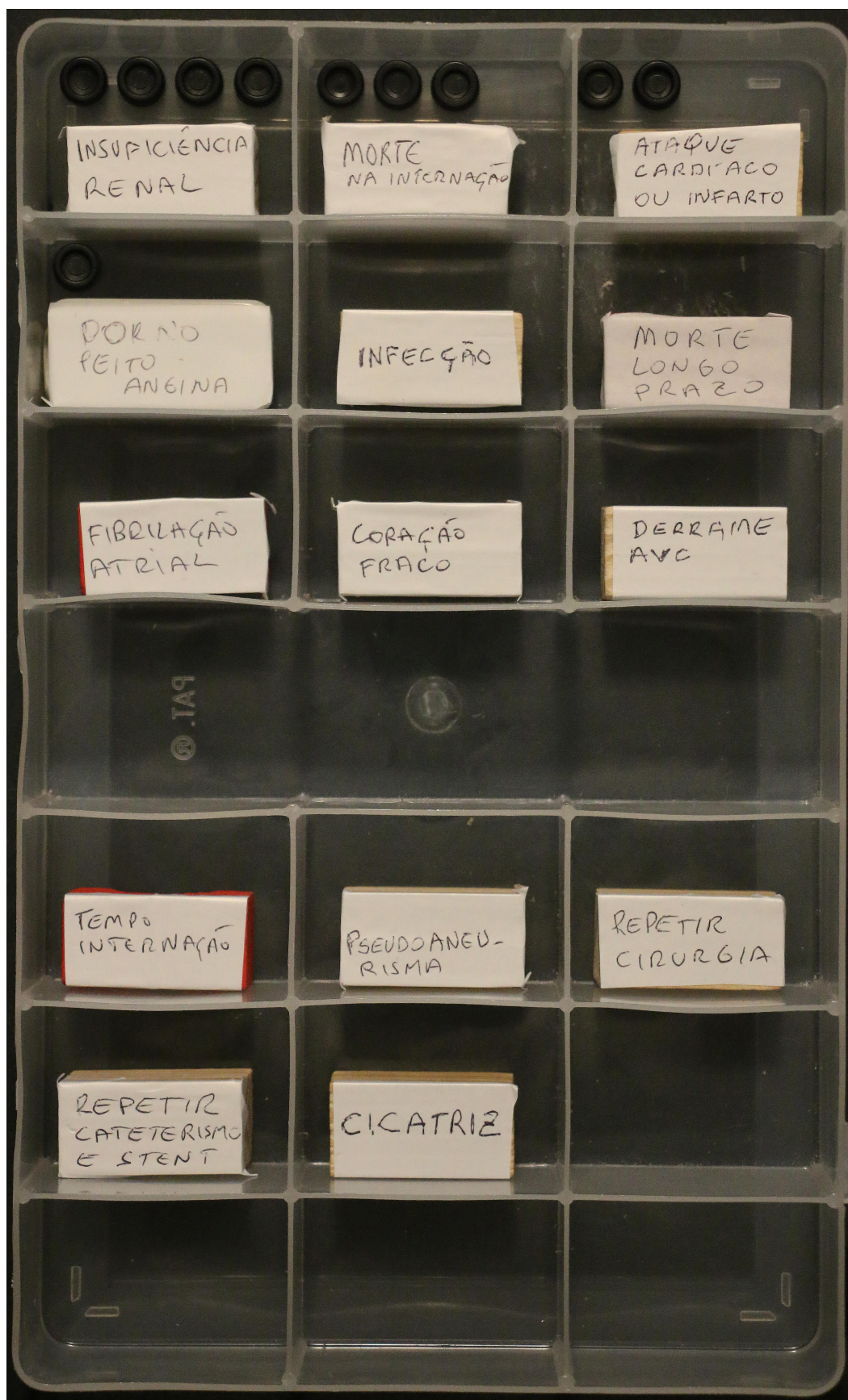
Figure 1 The dotmocracy rating method.