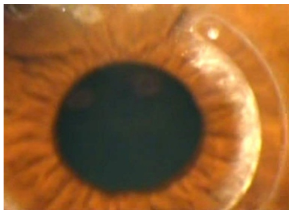
Figure 3 Crystalline deposits around the Keraring.

The analysis of our large number of case series (623 eyes) of ICRS (Kerarings) implantation using FS laser allowed encountering diverse number of complications and setting a protocol for dealing with each type, which improved our results over a period of 4 years. Most complications can be abolished if wise decision and meticulous manipulation were put into action. Yet, there are some complications that