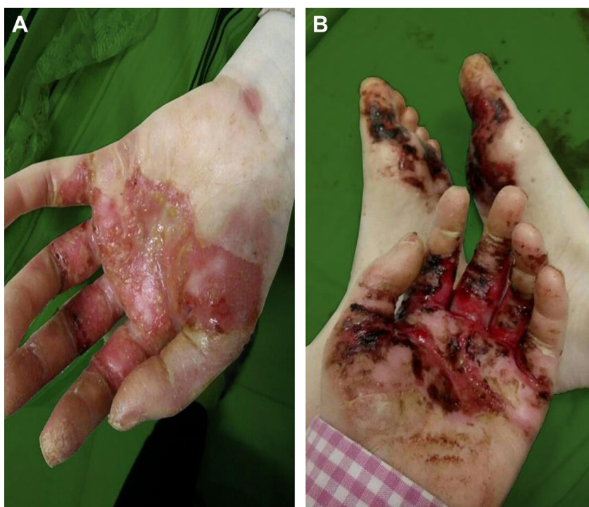
Figure 3 HFSR was caused during Act-D chemotherapy. Pictures show different grades.

Notes: (A) After the 2 courses of Act-D chemotherapy, mild edema, blister, and obvious erythema were observed in the palmar and metatarsal part of the foot, and the surface of the erythema was covered with exudate, and the peripheral skin was dried and desquamated. (B) After the 3 courses of Act-D chemotherapy, multiple ulcers were seen in the palmar and metatarsal area of both hands and feet, and the depth of ulcers varied from 1 to 3 mm. Bleeding and exudation were found on the surface of ulcer. The ulcer surface was covered with black scabs surrounded by a red halo, and the peripheral skin was dried and desquamated.