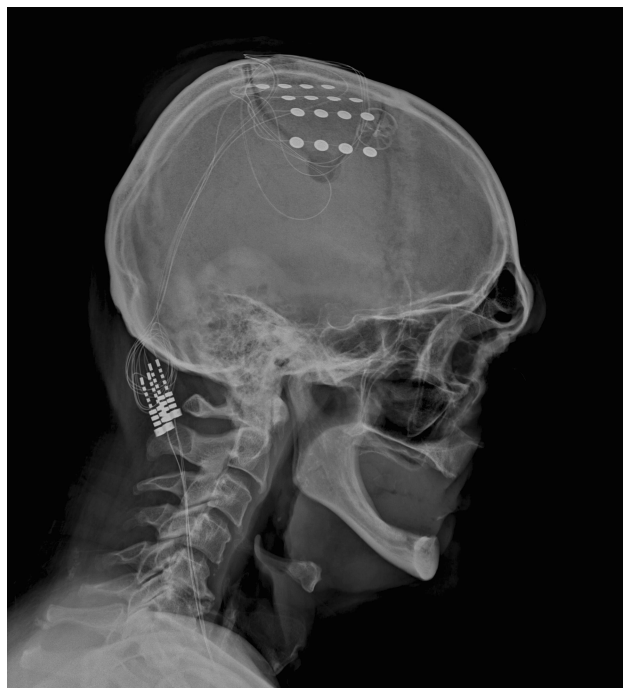
Figure 1 Four-paddle type electrodes placed on motor cortex in a patient 1 with thalamic pain predominantly in left upper extremity. 62 years old male with thalamic pain and MCS for 4 years had VAS=90 mm on tonic and VAS=70 mm on burst mode. Abbreviations: MCS, motor cortex stimulation; VAS, visual analogue scale.

Abbreviations: Distribution of pain: LUE, lower and upper extremity; MCS, motor cortex stimulation; V1, first branch of trigeminal nerve; V2, second branch of trigeminal nerve; V3, third branch of trigeminal nerve.