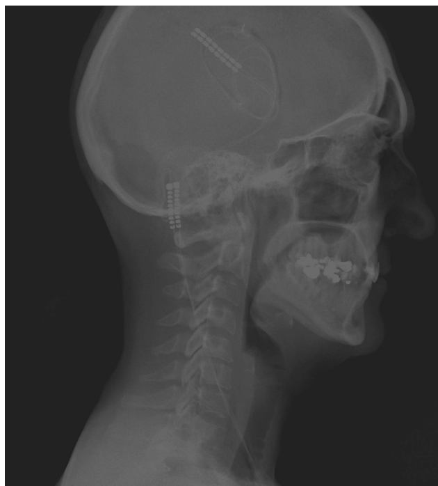
Figure 3 Electrode 2×8 contact placed on dura along motor strip in patient 2, 48 year old female with anaesthesia dolorosa on face with MCS for 2 years; VAS=70mm on tonic and 50 on burst mode.

Abbreviations: MCS, motor cortex stimulation; VAS, visual analogue scale.