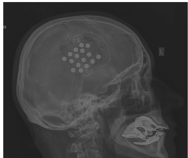
Figure 2 Electrodes placed on motor cortex in a patient 3. 60 years old female with atypical facial pain and with tonic MCS for 10 years had VAS=70mm on five tonic programs and VAS=40mm on burst mode. Abbreviations: MCS, motor cortex stimulation; VAS, visual analogue scale.

neuropathic facial pain. Out of 14 patients who received MCS, 6 were subjected to burst stimulation of the cerebral cortex. Patients with refractory pain lasting for a long period approximately 16 years (mean value) treated with tonic MCS for approximately 6 years (mean value) posed a challenge for achieving a satisfactory pain reduction.