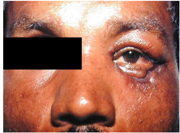
Figure 5 Scarring and ectropion of the left lower lid.