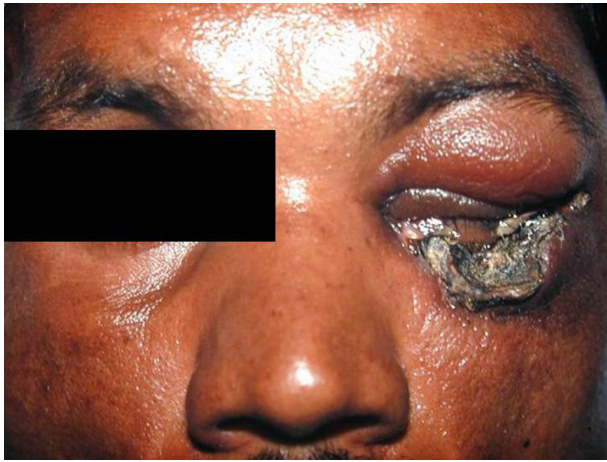
Figure 3 Black eschar involving the left lower lid with residual edema of the left upper lid.