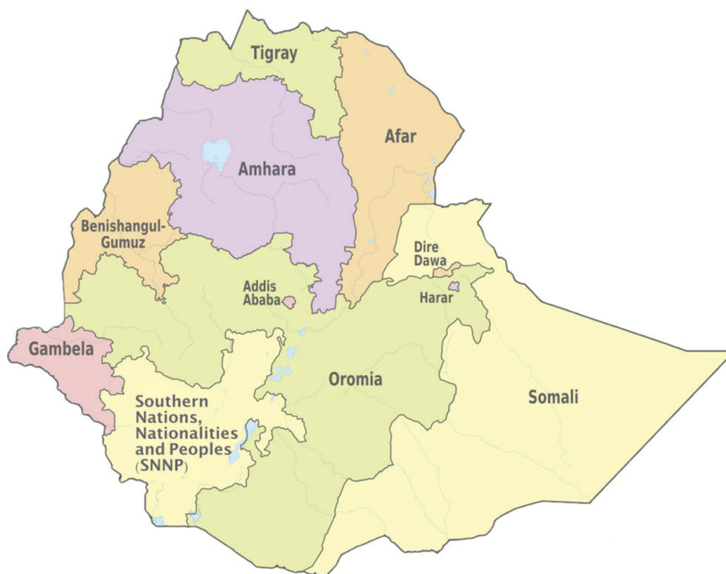
Figure 1 The maps of regional states in Ethiopia.

Despite various efforts made to prevent childhood diseases in Ethiopia, the prevalence has persisted since 2011. 4,21 Our findings showed that there is a huge disparity in the distribution of ARIs in children across the different regional states of Ethiopia. The highest prevalence of ARI, 16.8%,