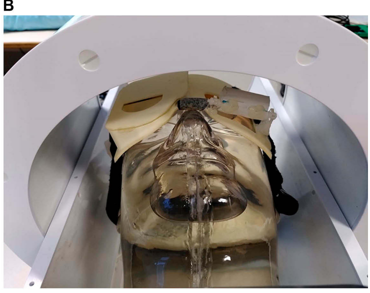
Figure I (A) Setup for high-resolution ocular magnetic resonance (MR) imaging, consisting of a dedicated receive eye-coil, with an integrated mirror. A fixation target is projected onto the screen at the end of the magnet bore. A cued-blinking paradigm is used to minimize blink-induced artefacts. (B) This image demonstrates how the patient's head is positioned within the MRI (magnetic resonance imaging) with the eye coil secured around the head.

on the T1-weighted images, while the T2-weighted scans are used to screen for scleral infiltration of the tumour. In addition, retinal detachment, a common complication of UM can easily be differentiated from tumour tissue on the post-contrast scan as a non-enhancing region.