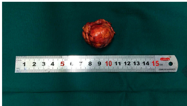
Figure 3 Postoperative mass specimen of recurrent adrenal ganglioneuroma.

approach can obtain a large operating space, and the anatomical marks can be clearly identified. 2 Although the operation space of retroperitoneal approach is small, it can still identify the anatomical signs such as psoas major muscle, perirenal fascia, peritoneum and kidney and so on through the accumulation of surgical experience, to fully expose the adrenal area for adrenalectomy. Some researchers 3 believe that the retroperitoneal approach can avoid abdominal stimulation and reduce the probability of intestinal injury. For small adrenal tumors ( \leq 2 cm), the retroperitoneal approach is generally chosen for laparoscopic adrenal surgery. However, for complex adrenal tumors, there are few reports on retroperitoneal laparoscopic surgery. Referring to relevant research reports, 4-6 tumors with the following characteristics are defined as complex adrenal tumors: (1) large adrenal tumors with a general diameter over 6 cm; (2) adrenal pheochromocytoma; (3) adrenal malignant tumors; (4) bilateral adrenal tumors; (5) adrenal tumors with a previous history of surgery on peri-adrenal organs; and (6) obese patients (body mass index > 25 ). For adrenal tumors whose