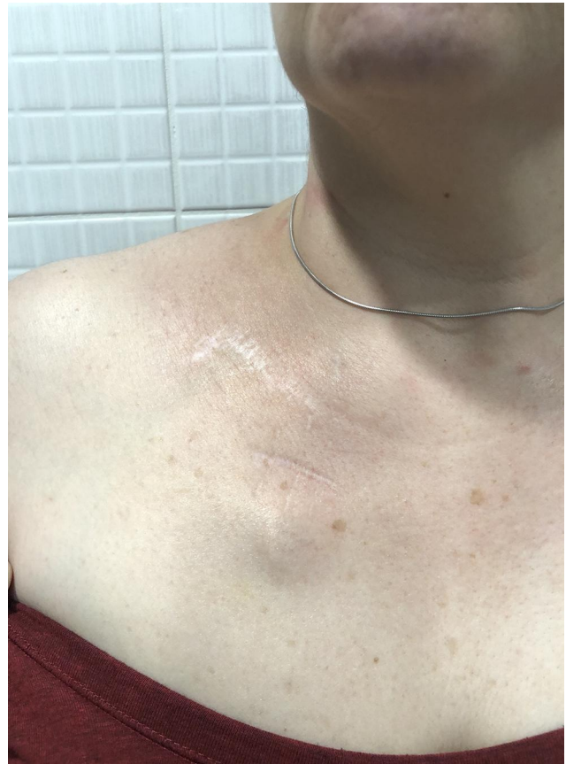
Figure 9 Six months post RT and AQ treatment.

interleukins, cytokines, and growth factors. Hence, it stands to reason that the enhancement of these regenerative protein titers by a topical application may optimize the wound-healing response. Although steroids are commonly advocated to treat radiodermatitis, there is a paucity in the literature on the treatment of the condition with these regenerative proteins. Platelet gels, rich in autologous growth factors, have effectively treated chronic cutaneous radiodermatitis, 15 however, administration of growth factors as creams and solutions has not consistently shown efficacy in their healing properties. 16,17