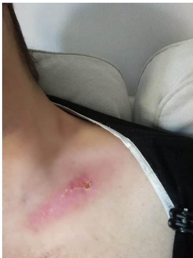
Figure 6 Day 14 post-RT. Day 17 post-AQ therapy. Pain score=1. ARD grade I.

The patient did not experience any complications and was relatively pain-free during the recovery. The outcome