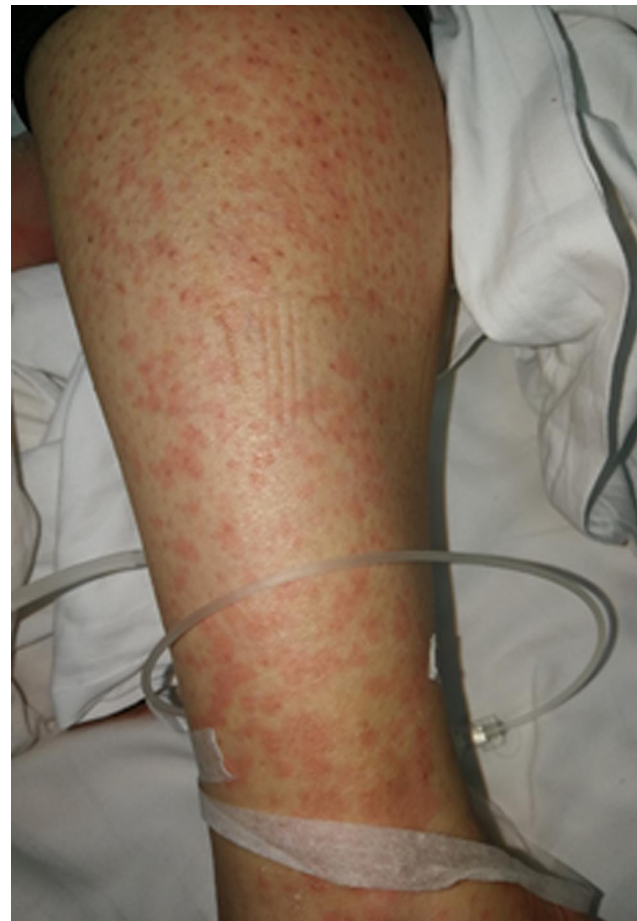
Figure 1 Erythematous rash over the left lower limb.

The patient in our case developed chest pain with erythematous rash after anisodamine injection. Based on 12-lead ECG, coronary angiography, immunoglobulin E and troponin I levels, the patient was diagnosed with Kounis syndrome induced by anisodamine. To the best of our