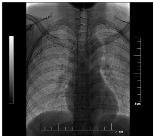
Figure 2 The catheter crossed over the clavicle to enter the BCV, the catheter tip was placed at the junction between the superior vena cava and the right atrium. Abbreviation: BCV, brachiocephalic vein.

Because the thoracic duct converges into the BCV at the confluence of SCV and IJV on the left, the right BCV approach was used to avoid lymphatic leakage caused by the thoracic duct injury. When the right BCV puncture failed, the left BCV was selected. Every time TIVAP was utilized, the skin at the port was disinfected with Iodophor. Before the infusion of any drug, the nurse flushed the catheter with 10 mL of 50–100 IU/mL of heparin saline or saline to detect catheter obstruction or subcutaneous leakage, and