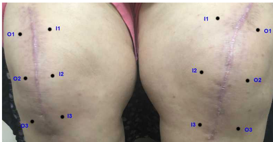
Figure 1 Dividing the TKA laterality and side into six regions for evaluation with von Frey filaments. I1: suprapatellar medial area of knee, I2: patellar medial area of knee, I3: infrapatellar medial area of knee, O1: suprapatellar lateral area of knee, O2: patellar lateral area of knee, O3: infrapatellar lateral area of knee.

surgical methods are ineffective. 12 Despite all the diagnostic tests and physical examinations performed on such patients, CPSP can occur after operation. The International Association of the Study of Pain defines CPSP as pain that occurs at least two months after surgical intervention. 2 An NRS score of 0 is classified as “no pain,” an NRS score of 1–3 is classified as “mild CPSP,” and an NRS score of 4 is classified as “moderate” and “severe” CPSP. 13–15 A review examining 14 cohort studies showed that discomfort and long-term pain developed among 7%–23% of patients after a hip operation and among